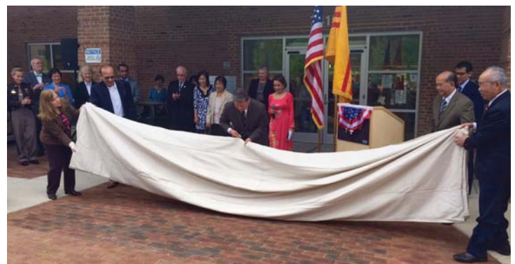
The new brick walkway at Thomas Jefferson Library is unveiled during the dedication ceremony for the Vietnamese American Community Gateway to Freedom Project Phase II in tribute to the 40th Anniversary of the Vietnamese Refugee Resettlement in the United States.